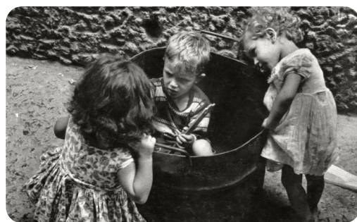
Naples, Italy – Children by Herbert List, 1961

Figurative forms portray their subjects, which are generally posed, as accurately as possible.