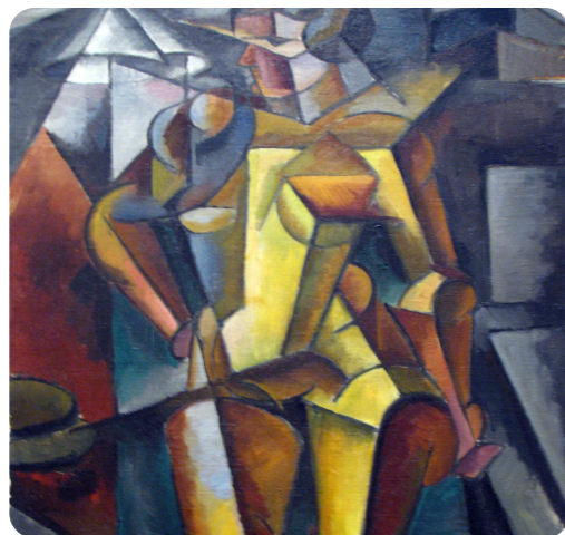
The Model by Lyubov Popova, 1913