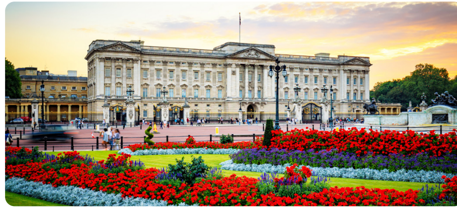
Buckingham Palace is in London, England.

Royal residences include palaces, castles and stately homes. Some of them are used for official royal business. Some are used as holiday or private homes. Many are tourist attractions.