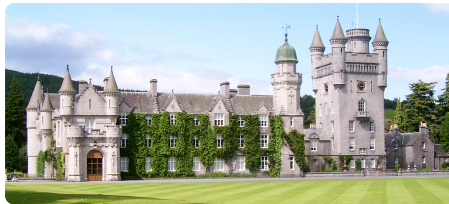
Balmoral Castle is in Aberdeenshire, Scotland.