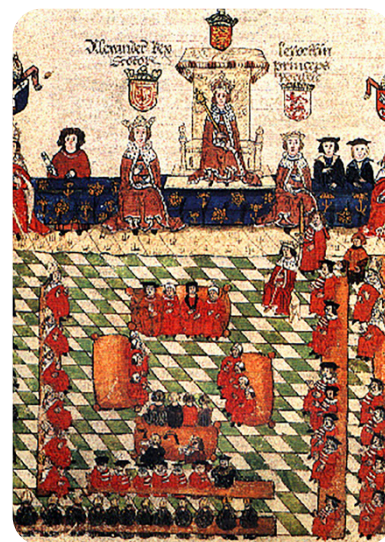
Edward I and the Model Parliament

The power of the monarchy has changed over time. In the past, some monarchs had absolute power. This meant that they could do whatever they wanted. Today, there is a constitutional monarchy. This means that the monarch is controlled by parliament and the government.