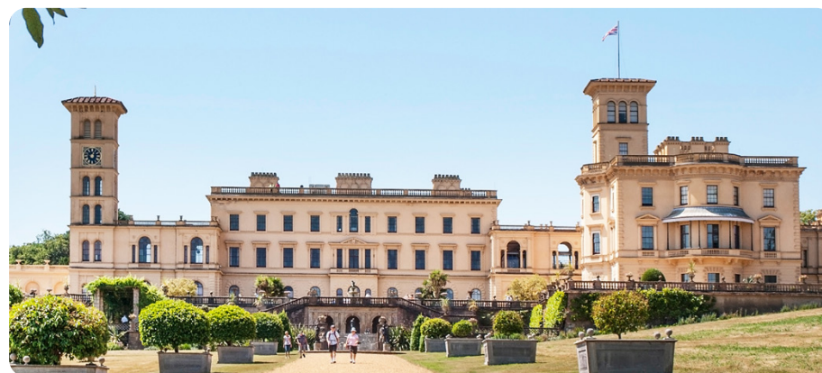
Osborne House is on the Isle of Wight, England.